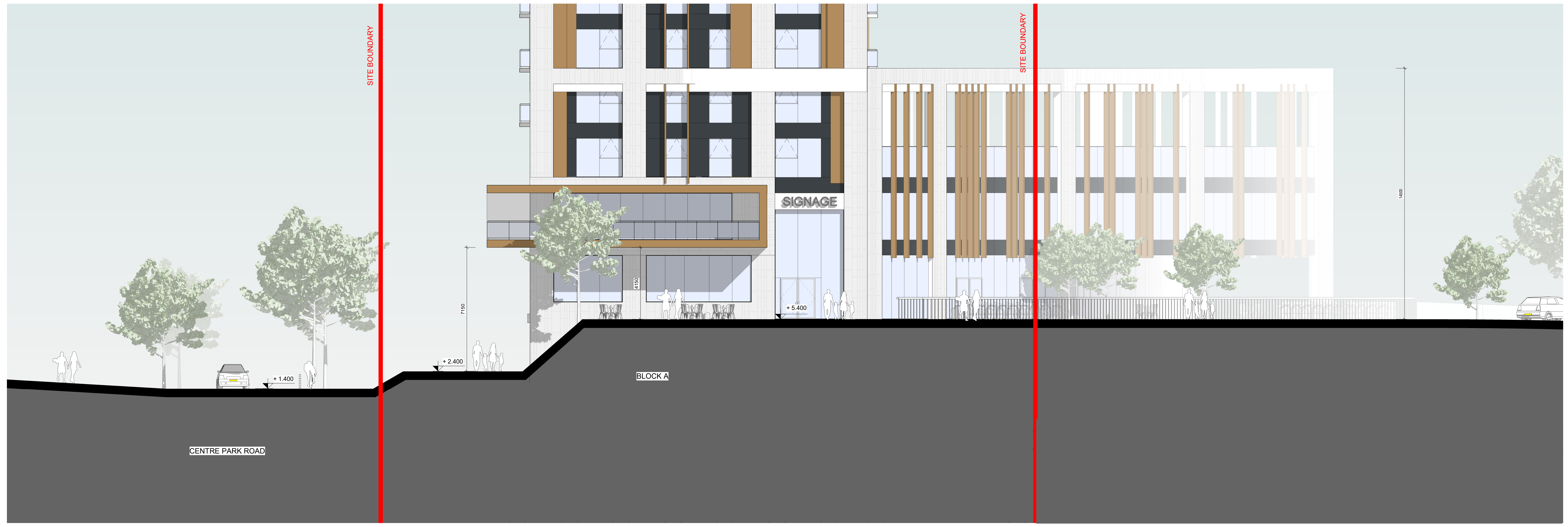
1 PROPOSED CONTEXTUAL SITE SECTION N-N - DETAIL 1 : 100

NOTE: FOR CLARITY PURPOSE TREES ALONG MARINA PARK AND CENTRE PARK ROAD ARE NOT BEING SHOWN